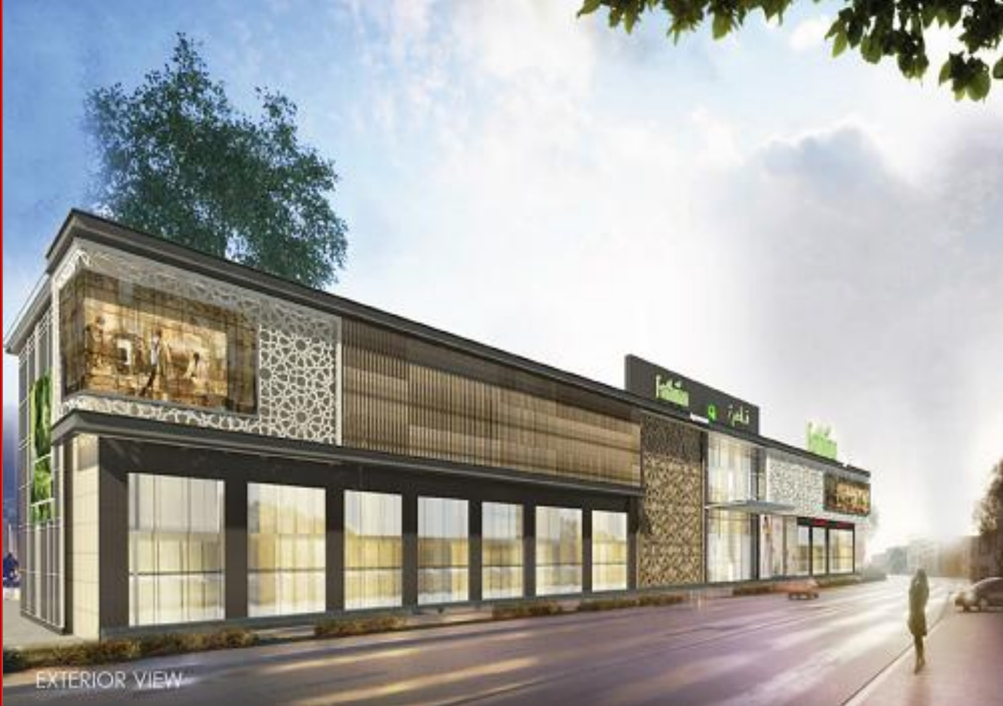
Project :Fathima Hyper Market Branch - 2 at Ras Al Khaimah - U.A.E Owner : Fathima Supermarket & Trading Company