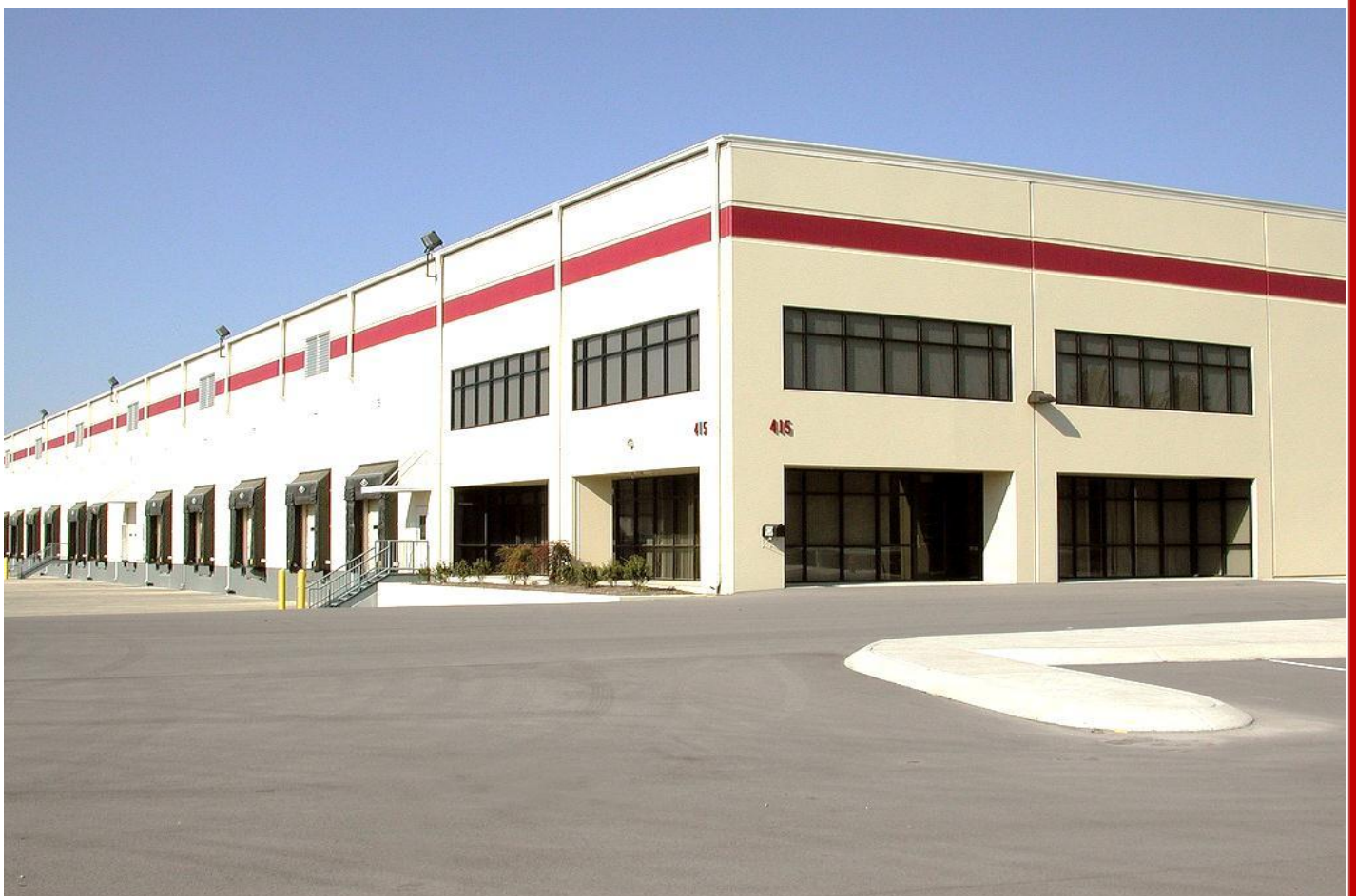
Project : G Warehouses at Hamriyah Free Zone, Sharjah Owner : Hamriyah Free Zone Authority, Sharjah