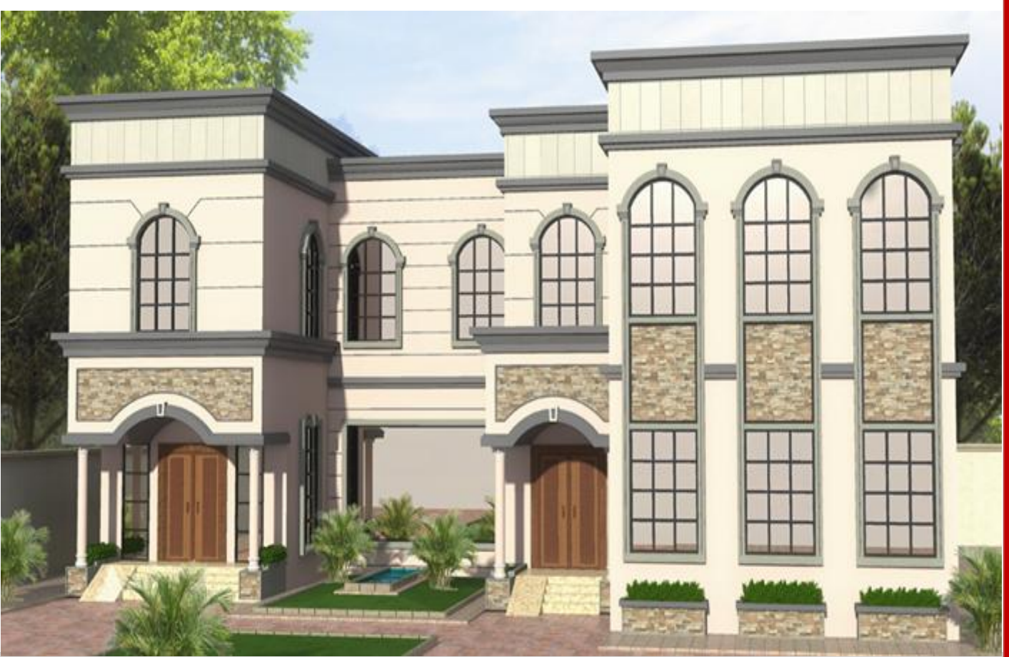
Project :Proposed G+1 Villa at Ras Al Khaimah - U.A.E Client : Sheikh Zayed Housing Programme